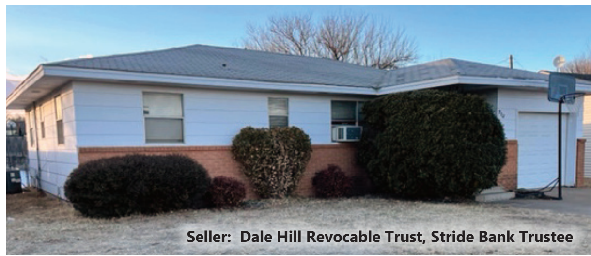
Seller: Dale Hill Revocable Trust, Stride Bank Trustee

A 3 Bedroom 1.5 Bath Home in a Good Location!