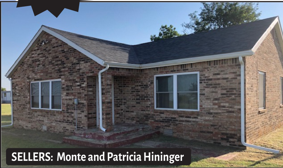
SELLERS: Monte and Patricia Hininger

A Well Kept 2 Bedroom Brick Home in Harmon on 1.55 Acres!